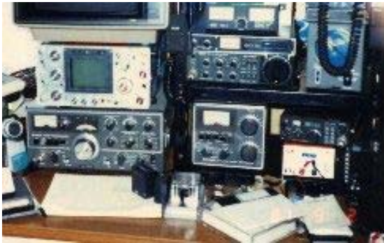
My Shack in 1987

My ham life started when I was eleven in 1979. An English teacher at my middle school who was a ham and enjoying chatting with people on the air showed me how interesting the hobby was. I spent a couple of months to pass the exam and got a ticket with JM1JOT. I don't remember who the very first station I worked was, but I do remember that I was so nervous that my voice was shaking and couldn't speak normally. I chose 6m to start. My first radio was an RJX-610. The 6m band was pretty popular for teenage hams and it was easy to make friends with. I got on the air after school every day, so it took less than a couple of weeks before I made my first eye-ball QSO. I have met a lot of interesting hams in the first several years of my ham life and quite a few are still keeping in touch. The RJX-610 had been my main radio until it was replaced with an IC-551 in 1982.