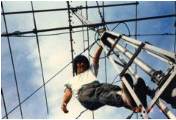
My ANT in 1987

My ham radio activity got to stop after I passed my first class license. Well, I ran into a new hobby, Rally or a kind of car racing. For my new hobby, I ended up selling most of my equipment except a small hand-held and a mobile radio. I won't tell you about that hobby here, but it was so exciting and worth selling the ham stuff. My blank period lasted about ten years until my wife and I moved over to the U.S. in 2000. For the first two years in the new country, I was pretty busy establishing my new life and catching up with some new responsibilities as a software engineer at my new employer. As I was getting settled in, I thought I wanted to have something fun... something fun like ham radio that I was absorbed in before.... Yes! That's it! Then I got back on the air with AE6DE (I took a vanity call K6KF later) from the SF bay area and I joined FISTS. This time my focus was definitely on CW. Constantly working some stations a week helped raise my CW speed little by little. That was so interesting. Plus I finally obtained my DXCC and WAS.