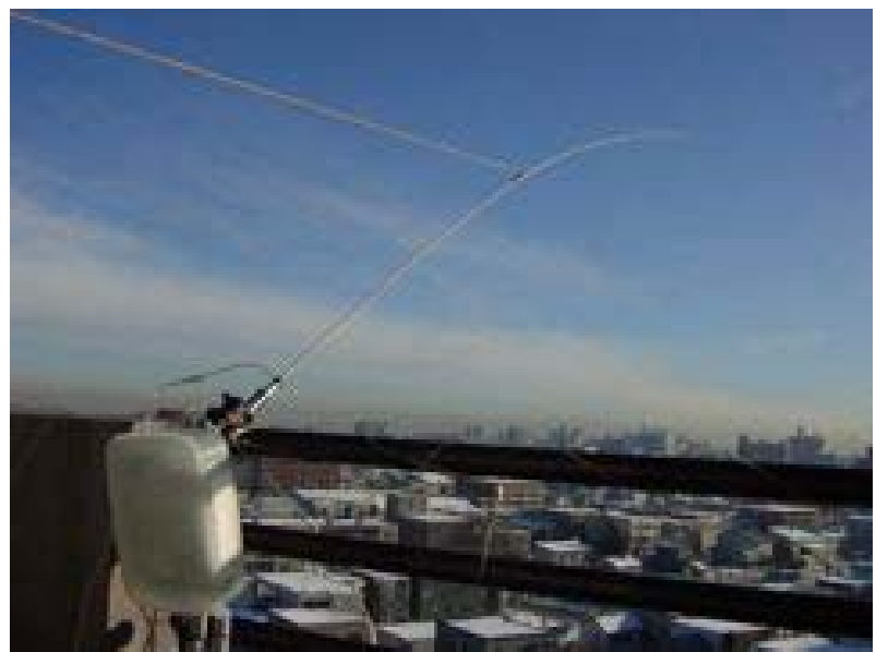
My ANT in 2006