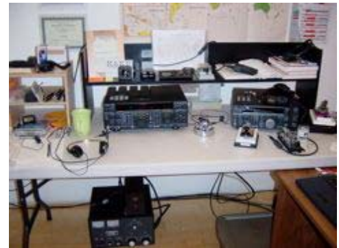
K6KF San Jose

After living in California for five years, I decided to leave the U.S. permanently for a new job in Japan. The new location is Hokkaido, the north island of Japan, where I dreamed of living in before. It's been four months now since I came back to this country. Here in my new apartment, I set up a small HF station with a 3 meter rod plus an auto antenna tuner. This set seems working so better than I expected that I can work NAs and OCs occasionally even on the 40m band.