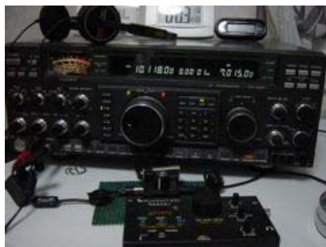
My shack in 2006