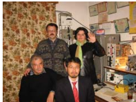
With 4J5A 4J8YL 4K4K